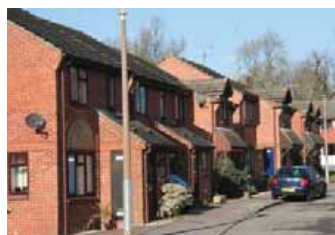
Cedar Drive Area