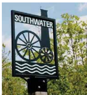
Southwater Parish Council