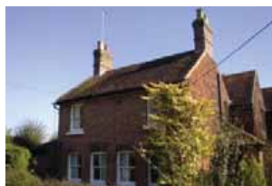
Two Mile Ash